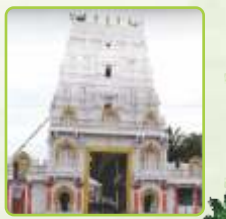
Venkateswara Swamy Temple