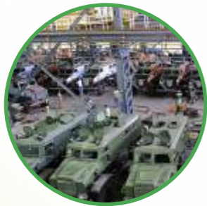
Ordnance Factory 2 Min Drive