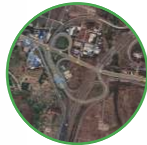
Muthangi Jn.(ORR) 15 Min Drive