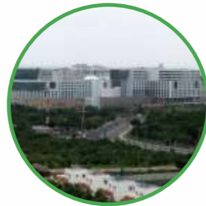
Financial District 25 Min Drive