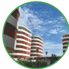
IIT - HYDERABAD 10 Min Drive