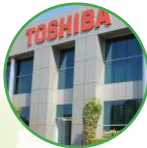
Toshiba Electricals 10 Min Drive